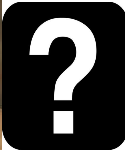
Rep. from NGV